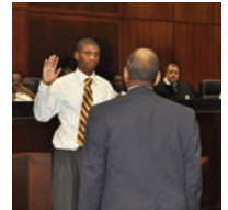
Don Hubert Scholars prepare for the Mock Trial Program