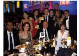
Kirkland D.C. attorneys and guests at The HRC Annual National Dinner