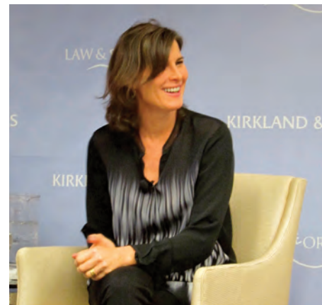
Author Claire Shipman.

On January 15, 2015, the Women's Leadership Initiative presented a Firmwide videoconference featuring Claire Shipman, broadcast journalist and New York Times best-selling co-author of The Confidence Code . The event was broadcast from the Firm's New York office.