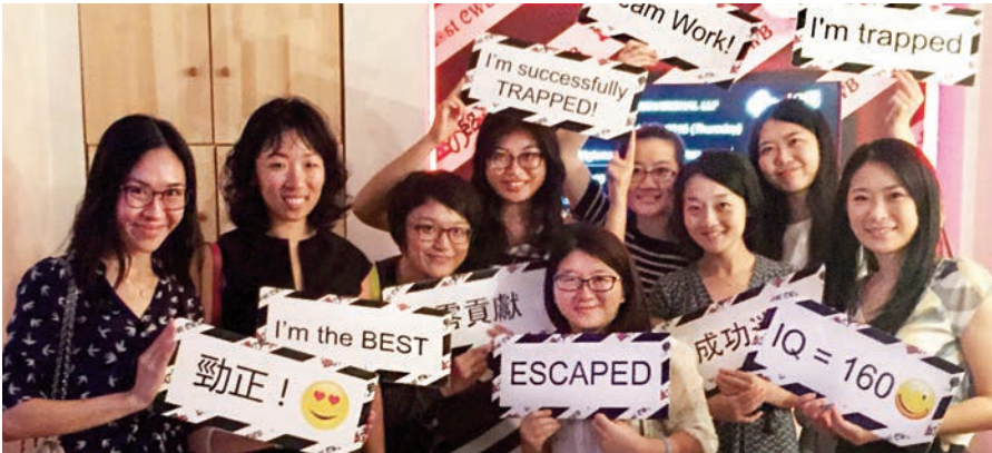
Women attorneys from Kirkland's Hong Kong office worked together to solve puzzles to escape a room during a team-building activity.