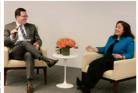
The DLS recently presented two "Path to Success" events featuring senior leaders at the Firm.