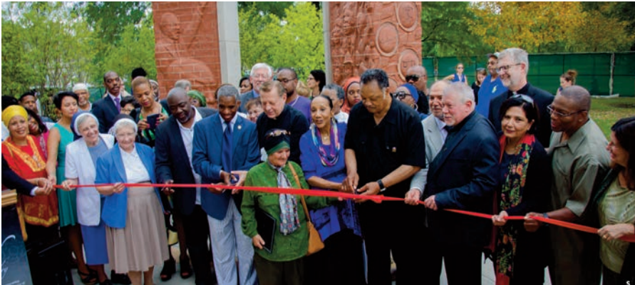
Kirkland is a sponsor of the Dr. Martin Luther King, Jr., Living Memorial Project in Chicago. The ribbon cutting for the art installation took place on August 5, 2016.