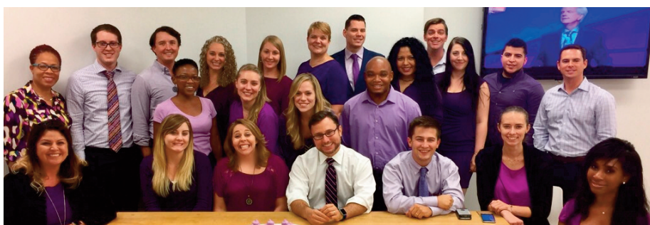
All of Kirkland's U.S. and international offices supported GLAAD's Spirit Day on October 20, 2016.