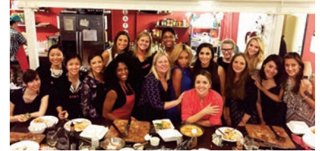
Los Angeles women attorneys enjoyed pizza and networking at the annual WLI cooking event.